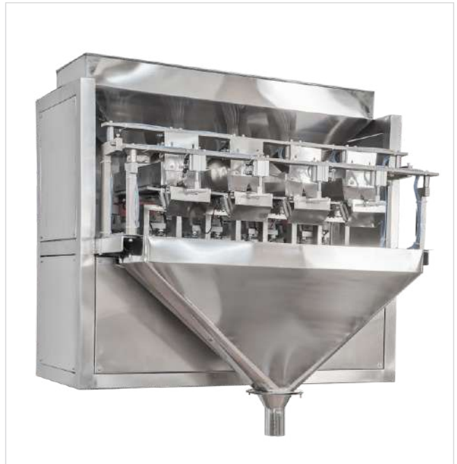
EASY PAC 4 HEAD WEIGHER