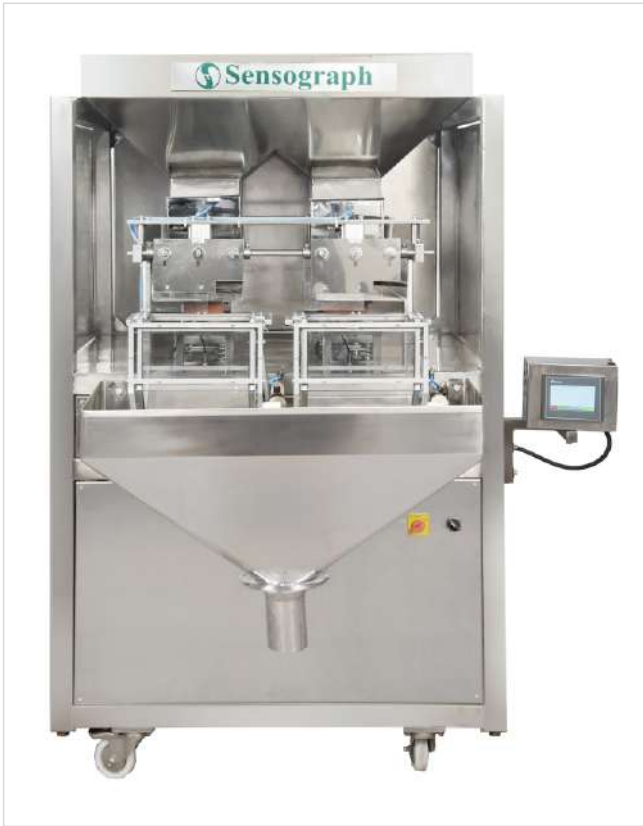
EASY PAC 2 HEAD WEIGHER