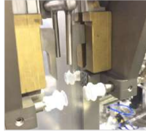
Zipper Open Station