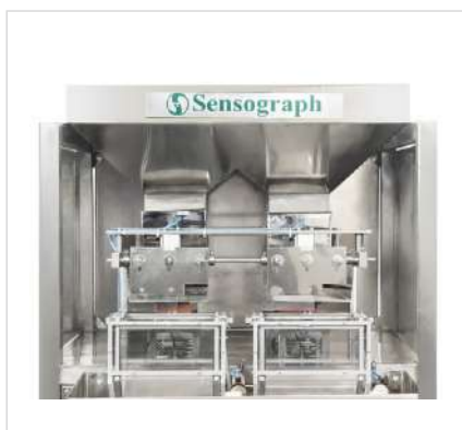
for Free-Folowng Items