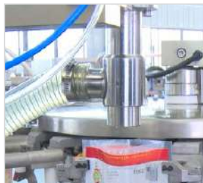
Liquid Filling Station