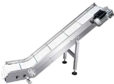
TAKE OFF CONVEYOR