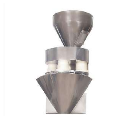
for Detergent Powder & Bhagar