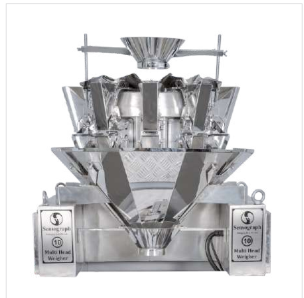
COMPACT 10/14 HEAD WEIGHER