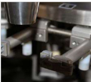
Granuler Filling Station