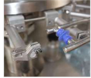
Bag Open Station