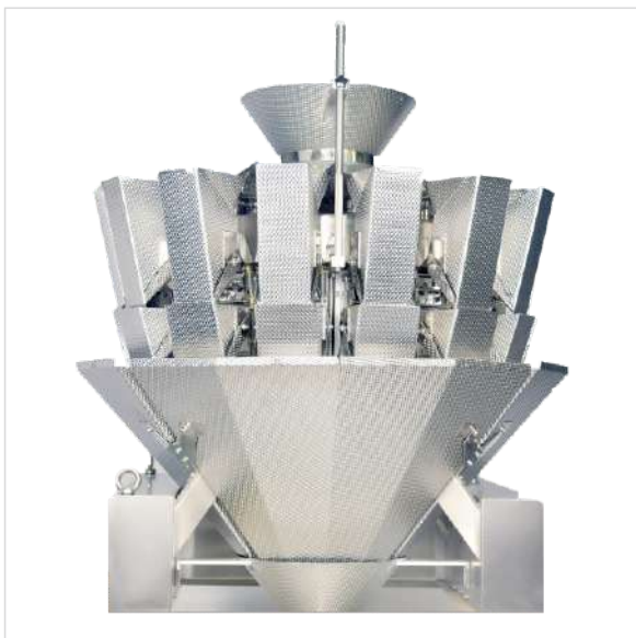
10/14 HEAD WEIGHER DIMPLE PLATED