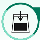
EASY PAC 2/4 HEAD WEIGHER