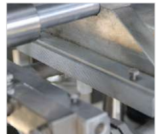
Sealing Station 2