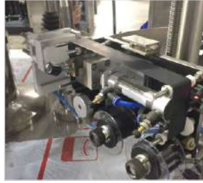
Date Printer Station