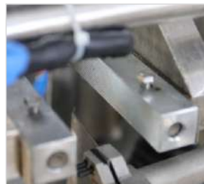
Sealing Station 1