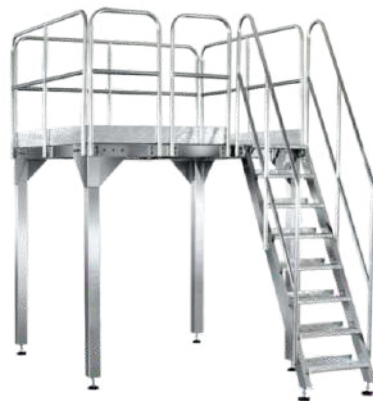
STAINLESS STEEL WORKING PLATFORM