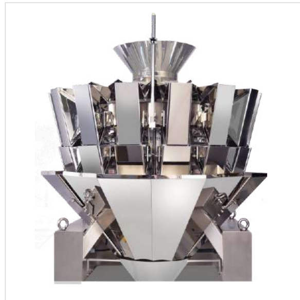
10/14 HEAD WEIGHER STANDARD