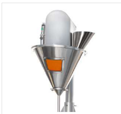
for Powder Items