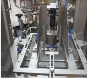
Pouch Input Station